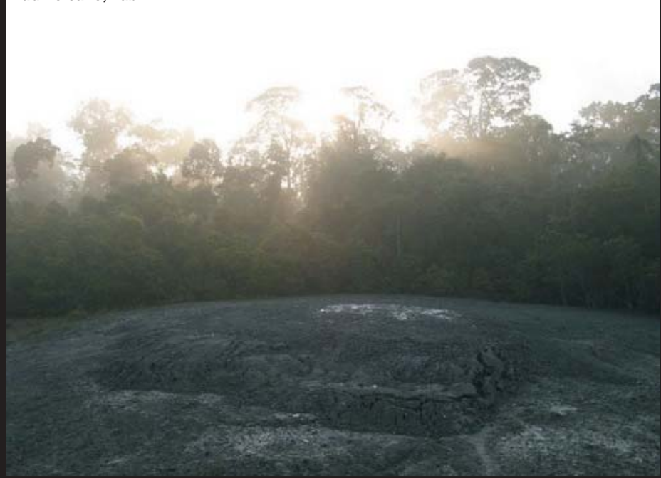
Mud Volcano, Tabin

So another tonne of stores moved back off the helipad, a first aid course successfully run, late night elephant encounter avoided, night at 30 metres overlooking a mud volcano, a risk assessment consultancy done and a loris and tipped up helicopter rescued, we headed back to KK for a much needed drink.